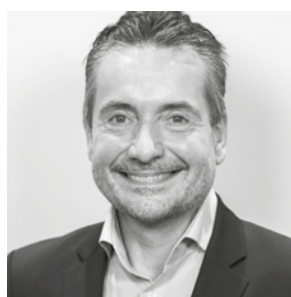
Tino Zeiske President

None of us can be sure what the future will bring, but we do know it will bring change – at a faster pace and on a bigger scale than ever before. Vision 2030 puts us on a strong footing to embrace that future. The chance to work alongside our members to make that vision a reality is an inspiring prospect. Now, together, we make it happen.